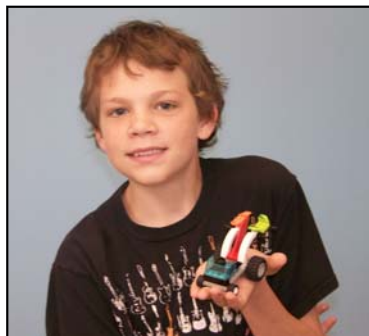
A youth (above) built this Lego creation at the Tween Lego Club on April 17.