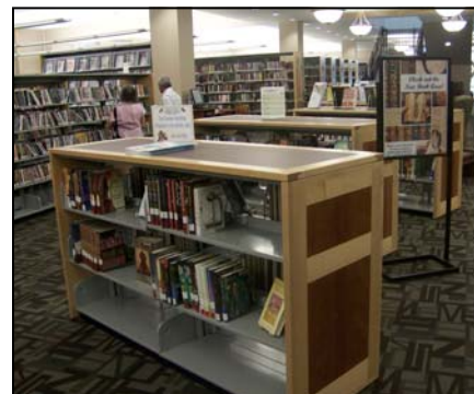
The Library has recently experienced some remodeling and rearrangements! We have a new and improved Check Out Desk. We have also moved the new book area (above) closer to the front of the building and rearranged the adult express internet computers (left). Check it out!