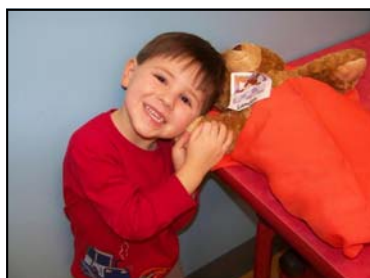
Children tucked in their teddy bears (left) for a fun-filled “stuffed animal” sleepover at the Library on Jan 28.