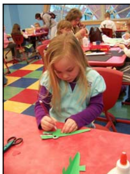
A child (above) makes a Valentine’s Day card on Feb 4.