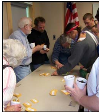
Participants (above) pick out seed packets at the Heirloom Seed Workshop on March 23.