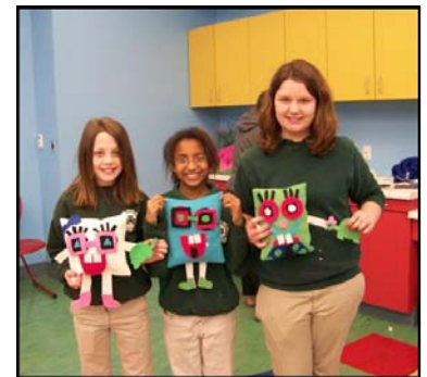
Teens (above) showed off their "Plush Manga" figures after the program on March 15!

Tweens have a lot of fun at the monthly Lego club. Children (right and below) picked out some Legos and built cool constructions on March 20.