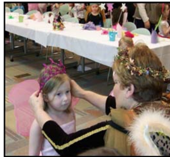
A little fairy (above) received a fairy princess crown.