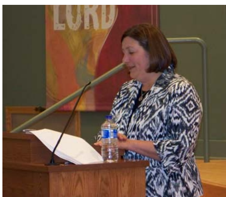
Kim Edwards (left) visited Frankfort on May 17 and read from her new release, The Lake of Dreams .