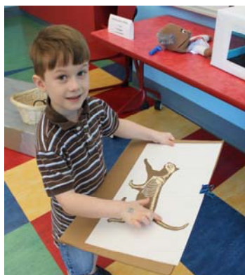
Kids (left) learned about animals at the Pet Play Imagination Stations on April 29.