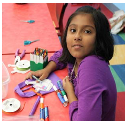
Children (left) made beautiful cards and gifts at the Mother's Day Craft Drop-in on May 5.