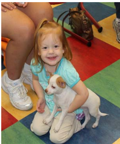
Children (left and below) had lots of fun at the Baby Pets program on April 26.