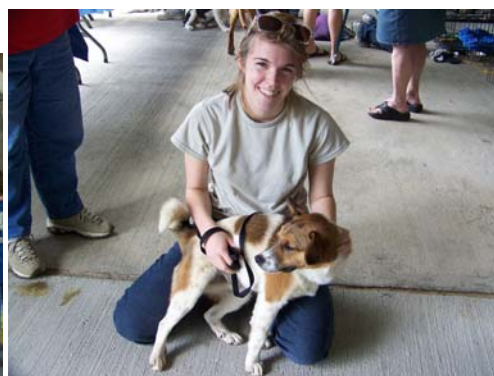
Our Pet Adoption Drive (left and above) on April 30 was a great success!