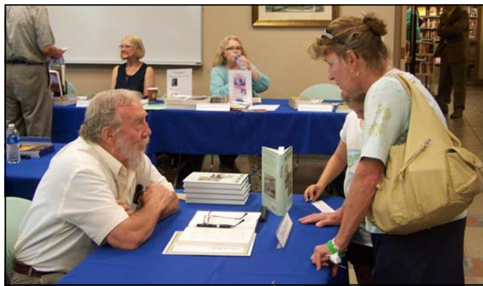
The 4th Annual Gathering of Authors (above and below) on Aug 27 was a grand success!