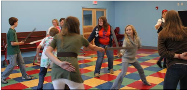
Teens (above) were very active participants in the Teen Sword Fighting workshop on Aug 17. En Garde!