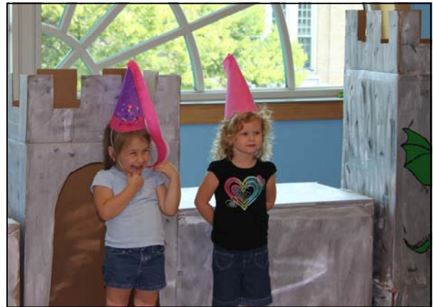
Princesses were safe in the castle (above) and shields were forged (right) at the Castles & Dragons Storyhour on Aug 18 & 19.