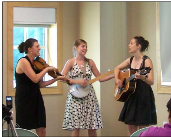
Sugartree, (left) a band from Berea, performed at the Library to great applause on Aug 26.